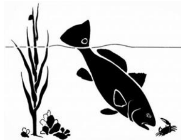
North Inlet-Winyah Bay National Estuarine Research Reserve